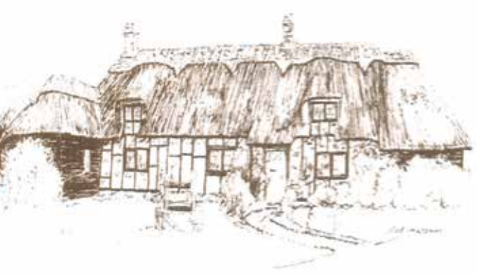
Long Thatch, Cotton End Road

Many combinations of footpaths and bridleways can be made into circular walks around the village. These circular walks can range from less than a mile to approximately 11km (7 Miles) using Luton Rd. FP5, FP7, FP17, BW16. Elms Lane, BW14, BW11, BW15, FP12, FP13, Duck End Lane and Bedford Road.