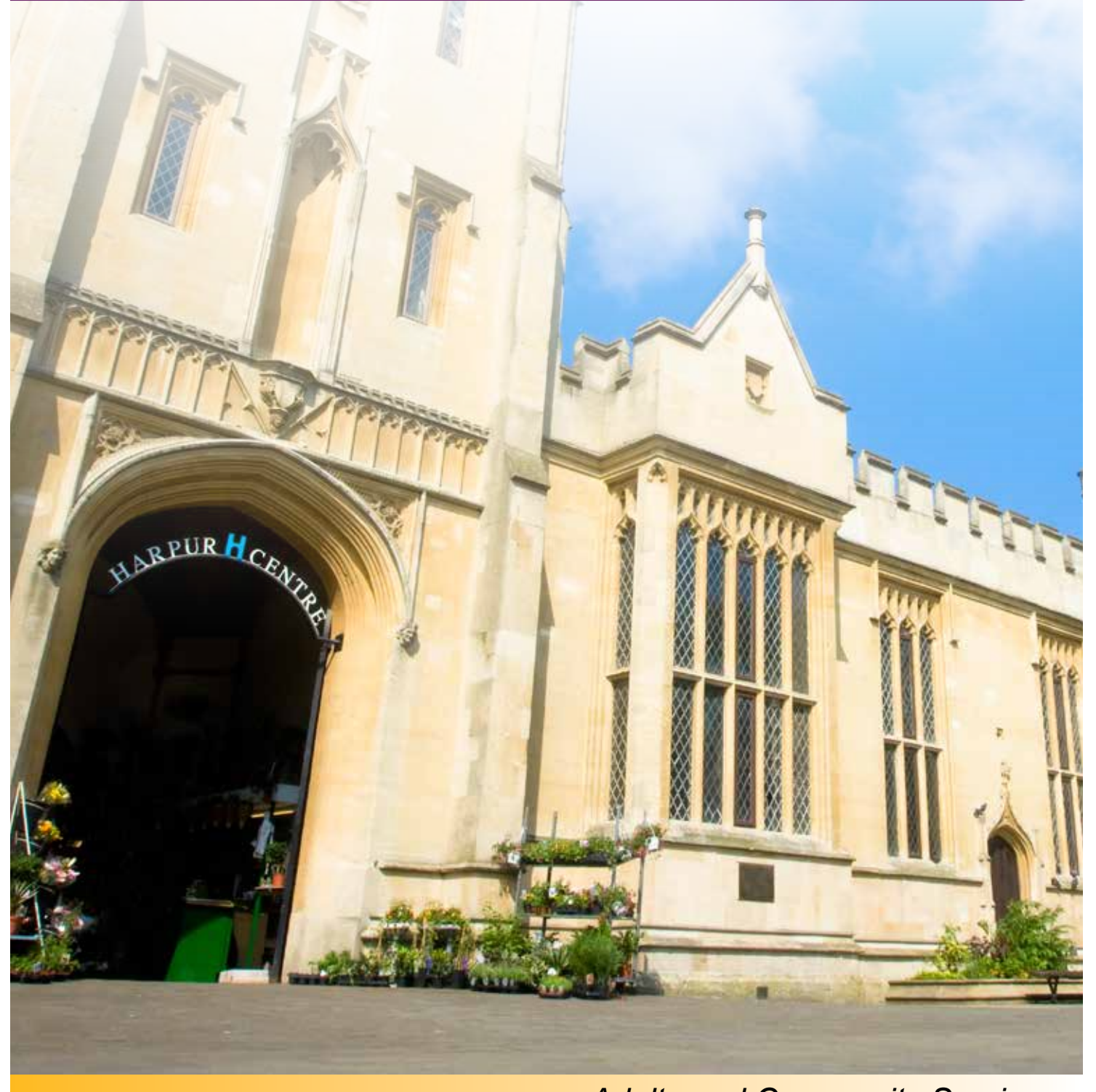
Adults and Community Services