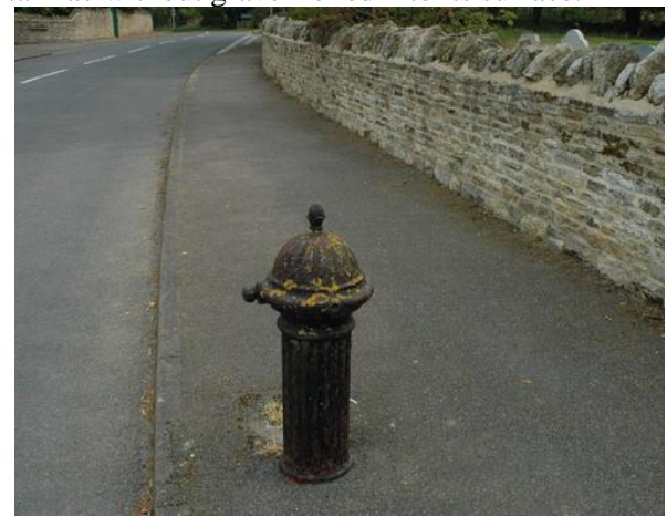
Concrete kerbing, lion's head standpipe, repaired churchyard wall

Rectory; footpath and road surfaces are of black tarmac without gravel rolled into its surface.