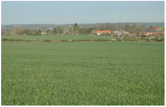
The village in its valley setting from the Thurleigh road

7 Bletsoe lies in a long-settled river valley landscape six miles north of Bedford. A villa site west of the village may represent the centre of a Roman farming estate, and 4<sup>th</sup> century burials were found associated with it. The place-name suggests Saxon settlement slightly higher up the valley side, dispersed around the 'hoh' or hill-spur where one 'Blaecc' once lived. There is no known archaeological evidence from these early times within the proposed Conservation Area.