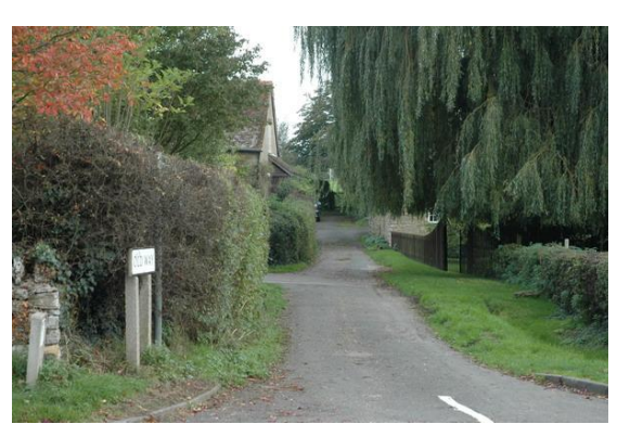
View down Old Way towards the parish field

32 Old Way probably originated as a route between the Great Green and the medieval open fields. A cul-de sac off it serves Old Way Row, a terrace of three built in the 1960s originally as farm cottages. Old Way runs between two houses, on the north side a multi-period 'L' shaped former farmhouse in limestone and timber-frame and on the right a smaller limestone cottage with a large modern rear extension. Beyond them are 19<sup>th</sup> century red brick outhouses and the gate leading to the footpath across the parish field.