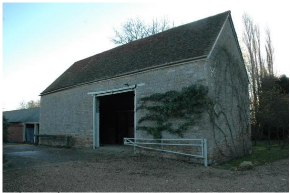
16<sup>th</sup> or 17<sup>th</sup> century stone barn at Bletsoe Castle

for houses, cottages and stone walls in the village is relatively thin-bedded coursed rubble from exposures in the Ouse valley. The other older cottages are timber-framed with wattle-and-daub infill and, originally at least, thatched roofs. In most cases, and certainly the long estate terraces, the timber frame was relatively slight and fully plastered as constructed. The 19<sup>th</sup> century chequer-brick cottages drew upon local clay fired in one of several documented local kilns; the bricks for model barns at Castle Farm probably came from further afield. These brick buildings have slated roofs; elsewhere, traditional thatched roofs are being well maintained in long straw and combed wheat reed.