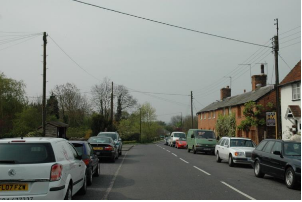
Overhead wiring looking south-west down the Avenue

52 There are several negative visual factors in the proposed Conservation Area. Overhead wiring runs up the Avenue and Memorial Lane with lateral spurs to houses.