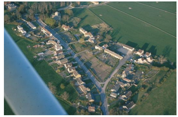
Village centre in mid 1970s: Village Hall centre right

8 The compact form of the village around an open space suggests mid 11<sup>th</sup> century planning by the new Norman lords, concentrating settlement below a parish church built in front of their main stronghold. Bletsoe Castle probably consisted originally of timber buildings within a circular bank and ditch. Later, buildings would have been replaced in stone and the ditch enlarged.