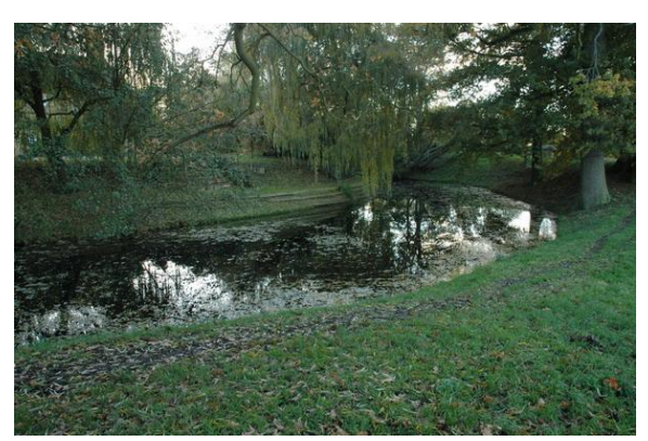
The moat at Bletsoe Castle

36 The medieval parish church is an important focal point, standing up on higher ground within the village in the centre of a compact and partly cleared churchyard. This has low stone walls on three sides holding in ground raised up on its east and south boundaries by centuries of burying; it was extended south at the original lower level in the late 19<sup>th</sup> century. The west front of the church faces the Avenue, on which is a solid timber Artsand-Crafts lych-gate erected by the St Johns in 1912. Mature trees on the north side are part of a generous provision around the road junction, including several large specimen trees planted in the churchyard.