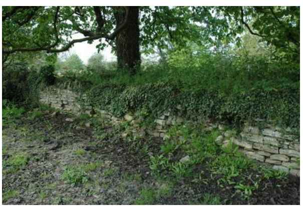
Unrepaired churchyard wall