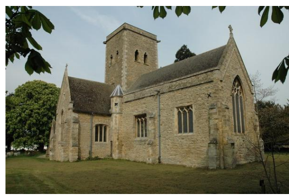
Parish church: chancel at right

37 Probably the Normans built the first stone parish church. Now dedicated to St Mary, it has an apparently simple cruciform plan with a central tower, but closer inspection shows a complicated sequence of development. What exists now dates mainly from the 13<sup>th</sup> and 14<sup>th</sup> centuries and there was substantial mid 19<sup>th</sup> century renovation. The chancel may incorporate some Norman work though the earliest surviving compartment seems to be the 13<sup>th</sup> century nave.