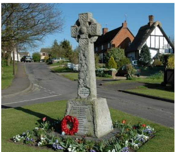
War Memorial, Memorial Lane, Pixie Cottage at right

18 The boundary crosses Bennetts Close to the eastern boundary of 17 Memorial Lane and runs along the south boundaries of the buildings until it meets The Avenue. It then crosses The Avenue before continuing north on the boundary of 16 The Avenue. Ito 7 Memorial Lane are modern properties and not of any particular historic interest or architectural merit in their own right. They have been included due as their frontages form a significant visual element in the setting of the former Great Green and the War Memorial.