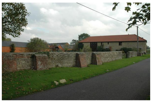
Coplowe Lane: stone walls of former barns

39 Castle Farm, east of Bletsoe Castle, is the site of the manorial home farm: the written survey of the St John Estate in the 1620s mentions building and yards. 19<sup>th</sup> century red brick model farm buildings probably incorporated limestone barns facing Coplowe Lane, shown on the 1<sup>st</sup> Edition of the Ordnance Survey Map and now represented by a low stone wall with raking brick buttresses.