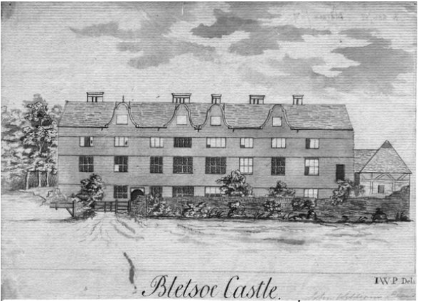
Bletsoe Castle c 1800 before loss of 2<sup>nd</sup> floor and attics

41 As in many rural villages, the surviving historic buildings reflect past social hierarchies and traditional uses, overlain by modernisation and conversion in recent decades. There is no definite evidence for the traditional view that Bletsoe Castle is the surviving wing of an originally quadrangular Tudor mansion, but the existing building lost its top storey and Dutch gables around 1800. Downgraded to a farmhouse after