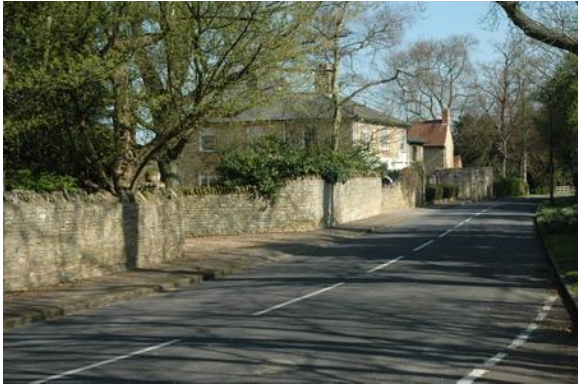
Stone walls looking towards the Old Rectory They are an important feature visually marking the end of the village on the road to North End and, coming the other way, its beginning before the churchyard wall comes into view and the road falls away down the Avenue.

38 Where the medieval priest lived is unknown, but his post-Reformation successor occupied the timber-framed building demolished when the present Rectory was built in the 1840s. This was altered and extended at least twice in the 19<sup>th</sup> century; its extensive grounds were sub-divided and the southern part was developed in the 1980s. The Old Rectory and a former service building, now a separate dwelling, form a distinct group connected with the main village by long, and in places impressive tall, stone walls through which two new entrances have been cut.