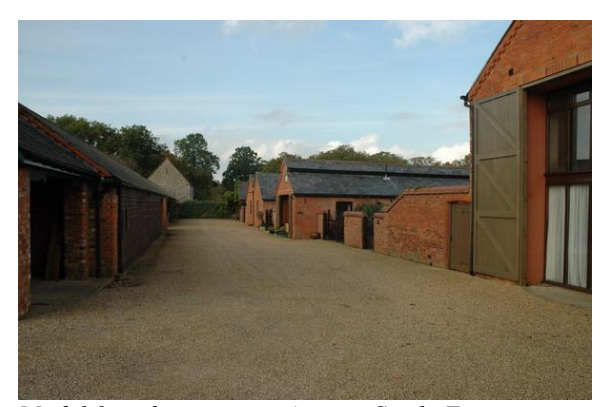
Model farm barn conversions at Castle Farm

The brick barns were converted to residential use in the 1990s, and, though some new-build has been introduced, the model farm plan still reads clearly.