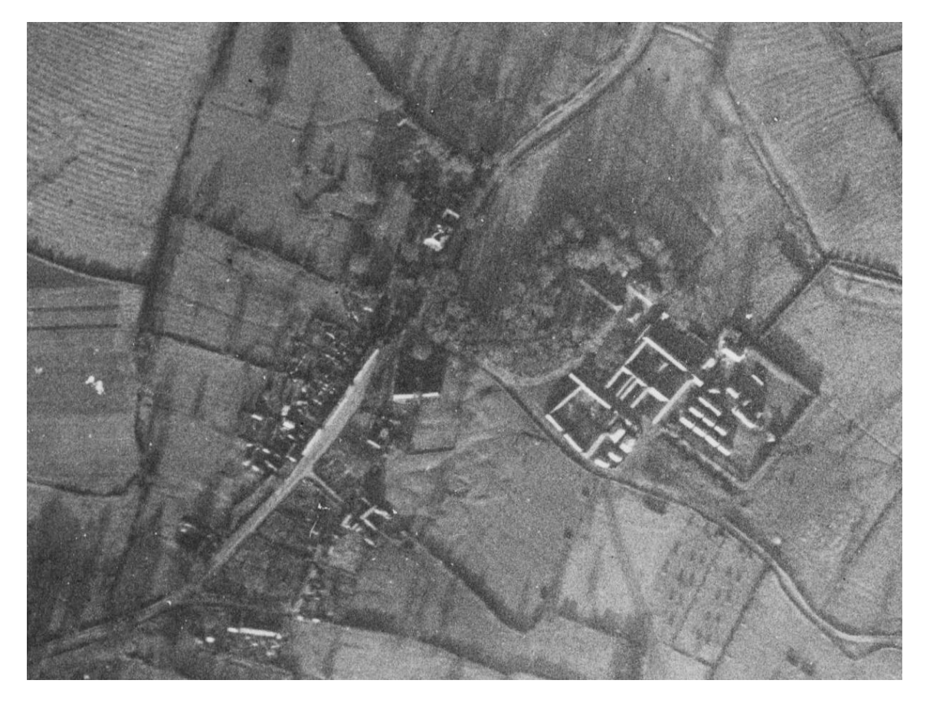
Bletsoe in the 1930s