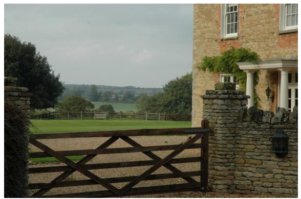
View across the Ouse valley at the Old Rectory

Several views from within the village look across the Ouse valley, from the top of Memorial Lane, from the footpath behind Captain's Close and past the south side of the Old Rectory.