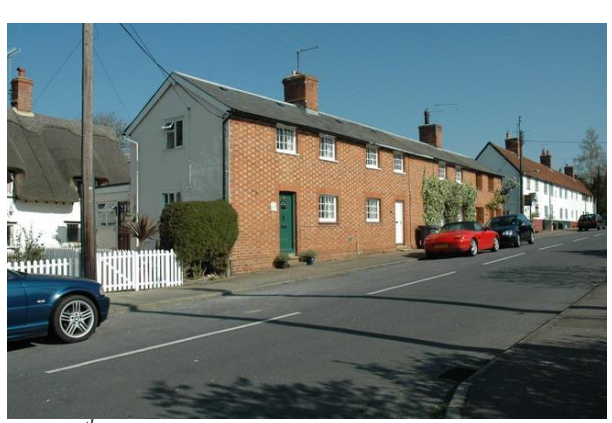
Mid 19<sup>th</sup> century brick estate cottages: the Avenue

45 In the 19<sup>th</sup> century, the Estate terrace tradition was continued in chequer brick and slate roofs, at the east end of the terrace in Memorial Lane, and in the south-western terrace on the Avenue.