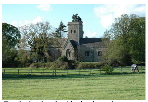
Church, churchyard and land to the south-east

26 The land south-east of the village comprises the paddock south-east of the church and the village field. There is access on foot to the village field from Coplowe Lane, along Old Way to Footpath 16, and past the Village Hall. The paddock between the village field and the church is important in both near and distant views of the church in its churchyard setting.