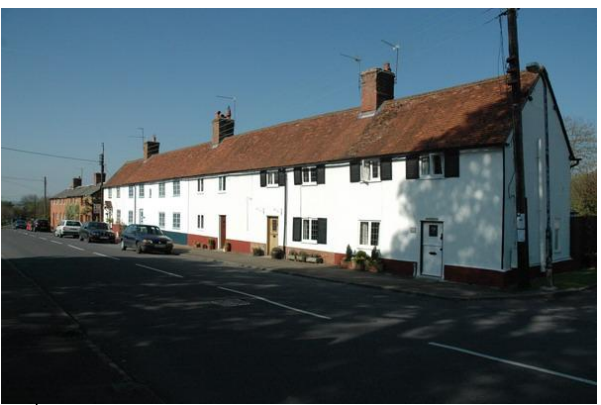
18th century terrace of estate cottages: the Avenue

44 To the 18<sup>th</sup> century belong the two terraces of fully plastered timber-framed buildings, in the Avenue and at Top Row. I Old Way, a small stone cottage, is probably originally of this date, as is the converted stone barn gable end on to Coplowe Lane. All contribute positively to the character and appearance of the Conservation Area.