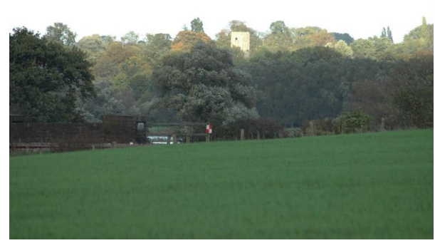
Church tower as a landmark from the Radwell road

13 Within the main village, the Avenue rises up to the terrace from its junction with the A6. There, the road forks: the single main road rises higher towards the parish church and Bletsoe Castle; Memorial Lane runs east up to the same higher level which holds the northern and eastern parts of the main village.