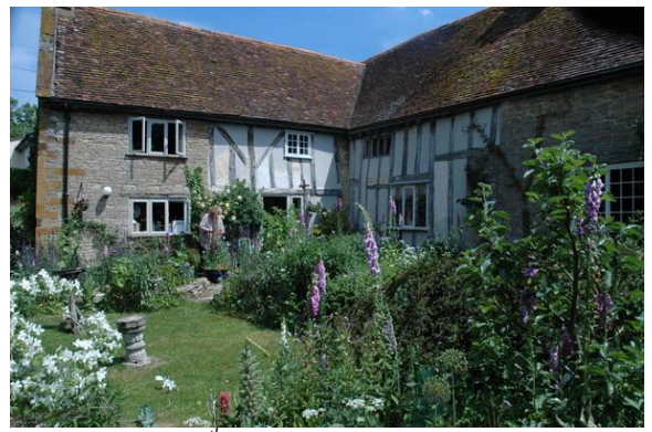
2-3 Old Way: 15<sup>th</sup> century open hall at right of centre

43 Several late medieval and early post-medieval buildings survive. Probably the oldest is 2-3 Oldway, beginning as a two-bay open hall with felling dates of 1459/60 for its primary timbers, and 1642/43 for a floor inserted within it.