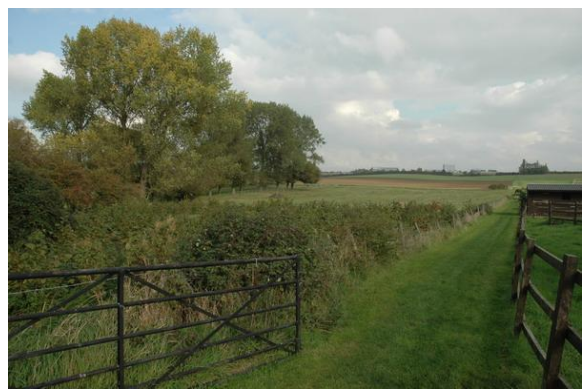
View out north-east towards site of Whitwick Green

27 There are several important views from within the Conservation Area out to the surrounding landscape. The view north from Bletsoe Castle looks across the former medieval deer park towards Park Farm, on the site of the medieval park keeper's lodge. From the north-east side of Castle Farm Barns, the view towards the skyline buildings of the Thurleigh Business Park takes in the site of Whitwick End, a Bletsoe hamlet demolished to make way for the wartime airfield.