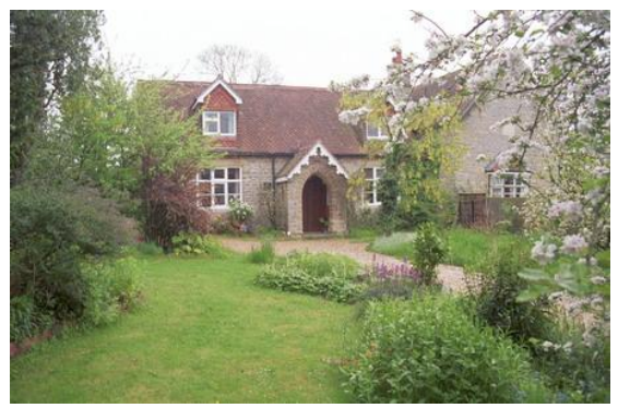
Former village school

30 The upper part, beginning around the break of slope level with the turn into Old Way, is more defined. On the left hand side thatched cottages set further forward than the modern bungalows are followed by two rows of Estate terraces set on the back edge of the pavement. The nearer, in a pleasant chequered mid 19<sup>th</sup> century local brick, encroaches upon the space of older timber framed cottages; the further is one of two later 18<sup>th</sup> century blocks with fully plastered timber frames. Beyond, on a set-back building line, is a later 1960s terrace in white brick replacing a demolished stone terrace that used to stand on the pavement edge. On the right hand side are characteristic low coursed limestone rubble walls, linking allotment area, school and churchyard. Just before the church is the former village school and school house, built in 1852, closed in the 1960s, and now forming two residences; the playground in front of the school is a mature garden.