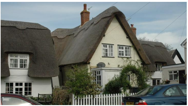
Well maintained thatch on the Avenue