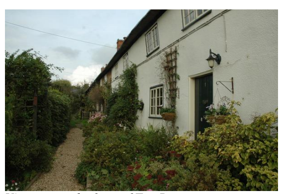
View across the front of Top Row

31 From the War Memorial, going along Memorial Lane towards the Village Hall, modern bungalows on the right hand side are followed by a truncated timber-framed house before the road rises on to higher ground with another terrace of Estate cottages. At the near end is a mid 19<sup>th</sup> century red brick addition or rebuilding, with a possibly 18<sup>th</sup> century element in the middle and is a 16<sup>th</sup> or 17<sup>th</sup> century timber-framed house at the higher far end. Opposite it, on the north side, at right-angles and gable end on to the lane is Top Row, the other later 18<sup>th</sup> century terrace built of fully plastered timber frame, with an attractive view along the flower-beds between the houses and the access path.