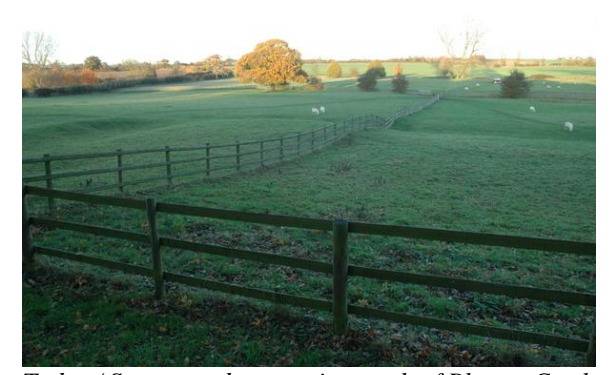
Tudor / Stuart garden remains north of Bletsoe Castle

A closer limit further south-west would be too tight on to the major Castle / garden earthworks and exclude some of the historic garden earthworks running into that field.