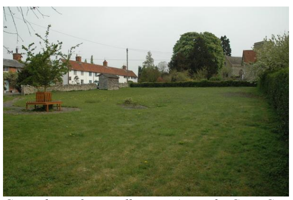
Grassed over former allotment site on the Great Green

25 The centre of the village is less open visually than it was fifty years ago, due to the growth of trees and hedges which have made its subdivisions as conspicuous as the spaces themselves. Next to the former school is the David Bayes Memorial Garden. Two smaller areas between Old Way and the Avenue and in front of Old Pear Tree Cottage are privately owned. The largest, between the Avenue and Memorial Lane retains several apple trees from its days as allotments.