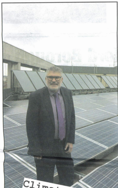
Climate Change Fund