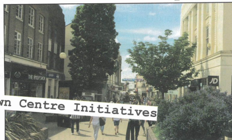
Town Centre Initiatives

From the town centre to our local neighbourhoods, from our local to our wider environment, and from our young people to those of all ages seeking employment, this funding will have a positive impact on people and places right across Bedford Borough."