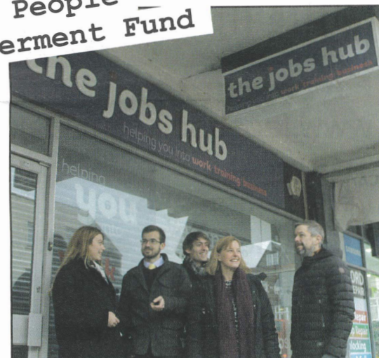
Young People Empowerment Fund