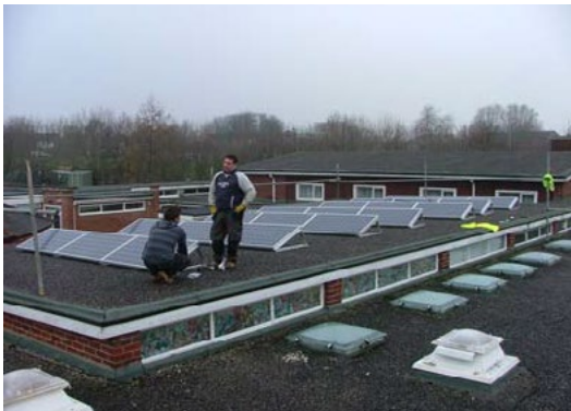
Solar PV panels being installed on Brickhill Lower School's roof

Scott Lower, Brickhill Lower and Beauchamp Middle Schools in Brickhill each had a 3.88 kWp solar photovoltaic (PV) system consisting of 21 panels each, installed on their roofs, with funding from the local councillors' Ward Funds and 50% match-funding from the Mayor's Climate Change Fund.