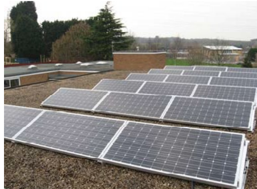
Solar PV panels installed on Scott Lower School's roof

Power Generation Display Units were also installed in the reception or hall at each school to raise awareness of the installation of the solar PV panels to the pupils, staff and visitors to the school.