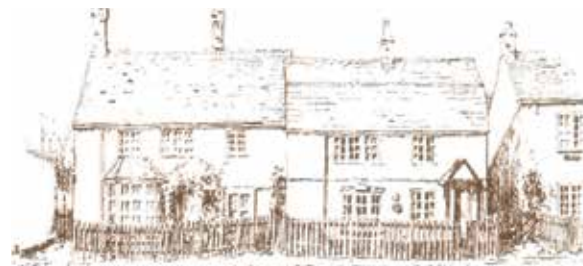
Cottages near Elms Lane

According to the Domesday Book, at the end of Cotton End Road there used to be another hamlet called Westcotes, probably where Littleworth is now. Near here down Elms Lane is Manor Farm, thought to be the location of Nigel de Albini's Manor. Much nearer the centre of the village on Cotton End Road is another Manor Farm, thought to be the likely location of Countess Judith's (sister of William the Conqueror) manor of Winessamestede, the second manor of the village mentioned in the book.