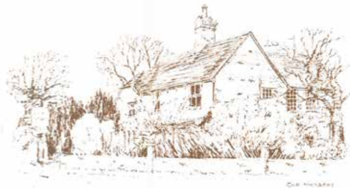
Manor House, Cotton End Road

There is good off road parking available in the village car park in Whitworth Way, behind the Methodist Church, and in the lay-by on Bedford Road to the north of the village crossroads (see map). Some of the main roads in the village can be used for parking but some are narrow and unsuitable, so please exercise care. The lanes are even narrower and should not be used for parking.