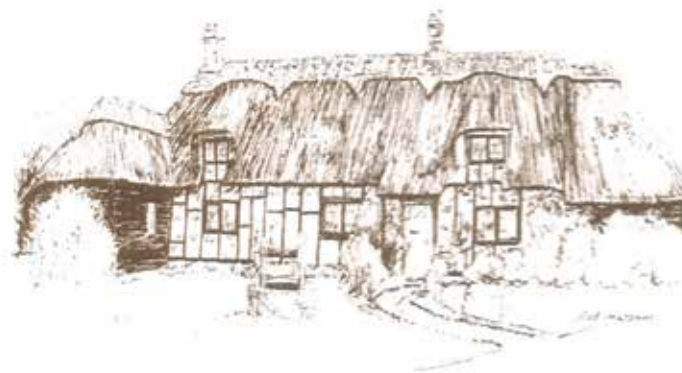
Long Thatch, Cotton End Road

Many combinations of footpaths and bridleways can be made into circular walks around the village. These circular walks can range from less than a mile to approximately 11km (7 Miles) using Luton Rd. FP5, FP7, FPI7, BW16. Elms Lane, BW14, BW11, BW15, FP12, FP13, Duck End Lane and Bedford Road.