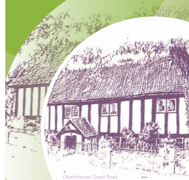
Church House Church Road