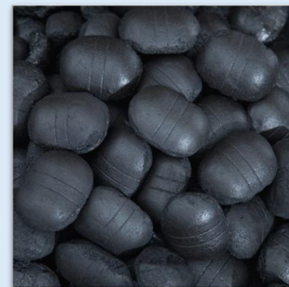
Smokeless Coals / (Semi) Anthracite

Find an authorised fuel for your open fireplace or NON- DEFRA approved appliance