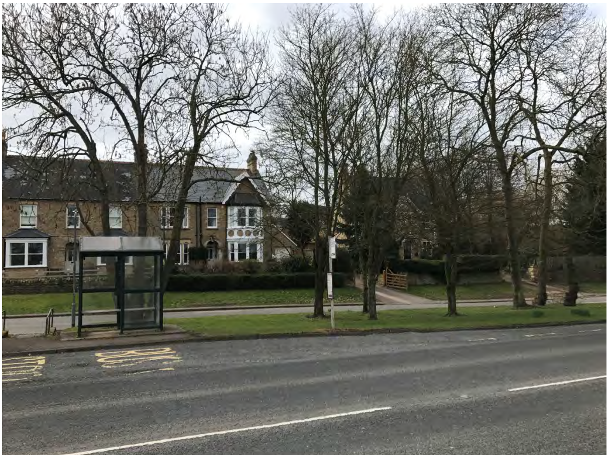
Figure 2 Site 6: Priory Farm (view from Bedford Road, housing opposite the site)