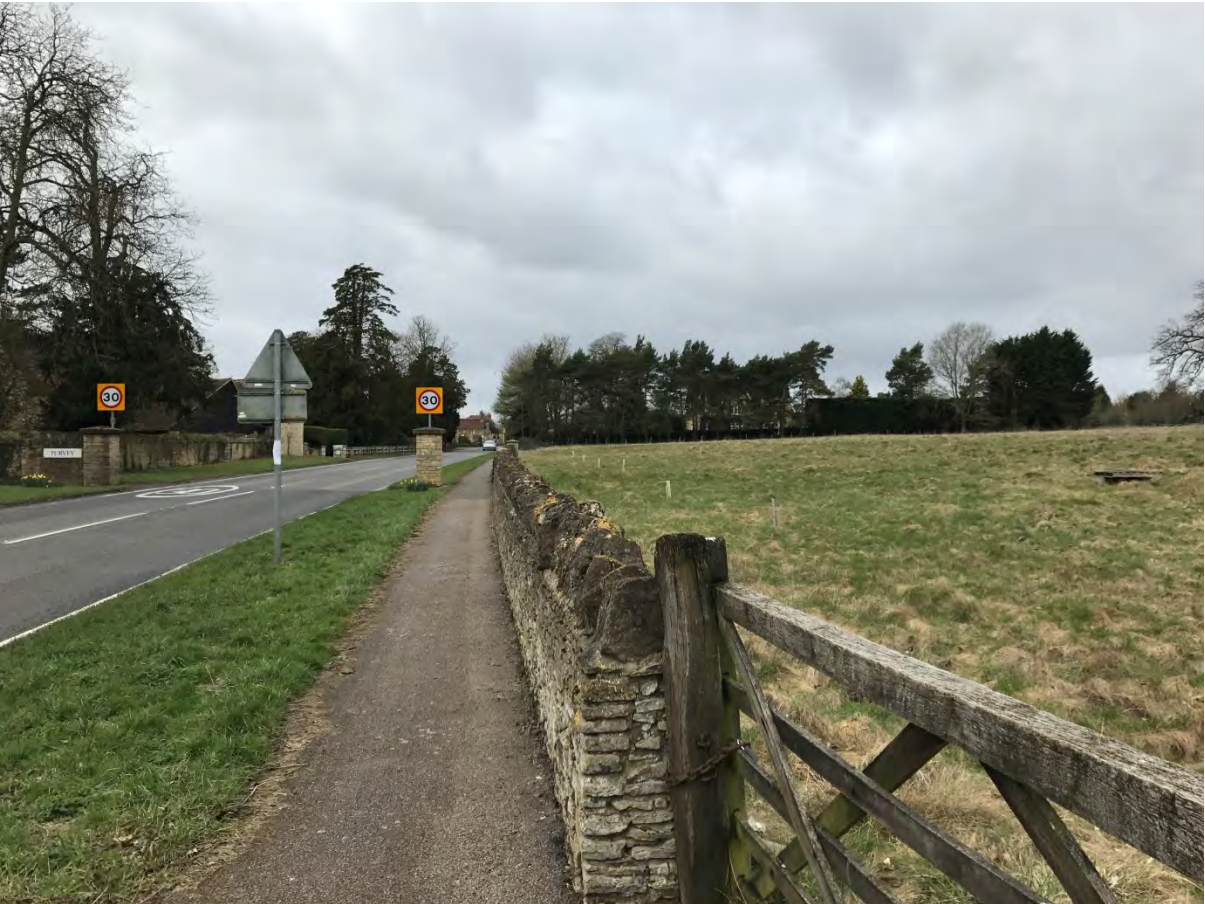
Figure 2: Site 10: Bedford Road Context