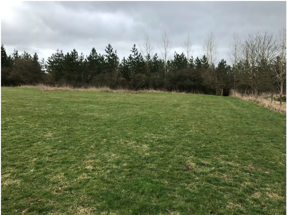
Figure 2: Site 5: Land to the West of Turvey (off Bakers Close)