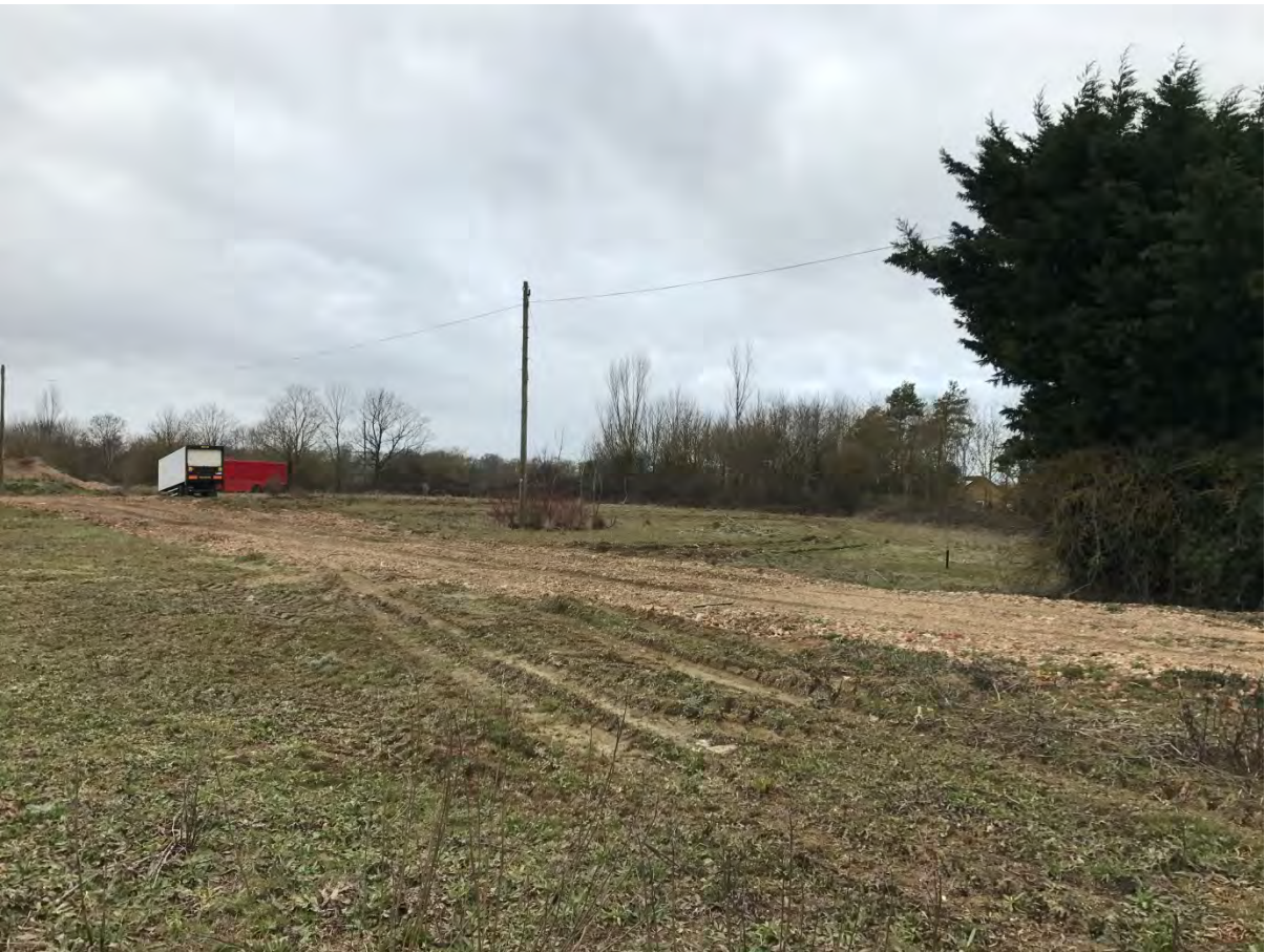
Figure 2: Site 8: Land off Station Road