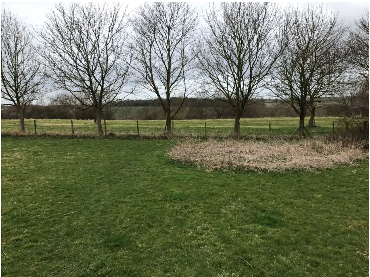
Figure 3 Site 5: Land to the West of Turvey (off Bakers Close)