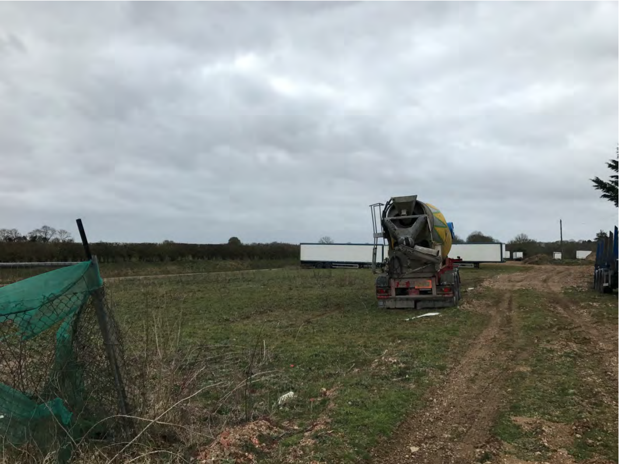
Figure 1: Site 8: Land off Station Road