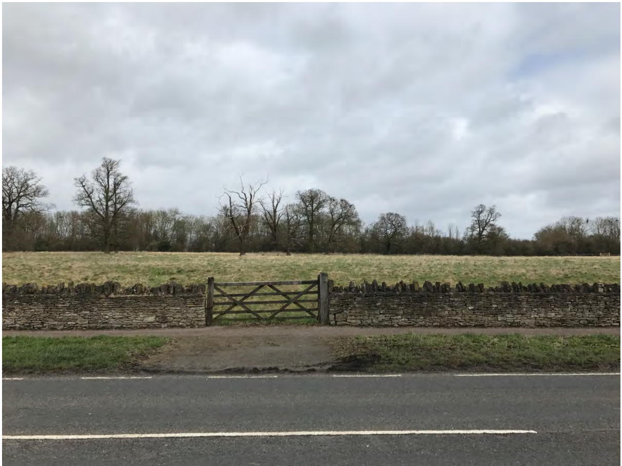
Figure 3: Site 10: View from Bedford Road