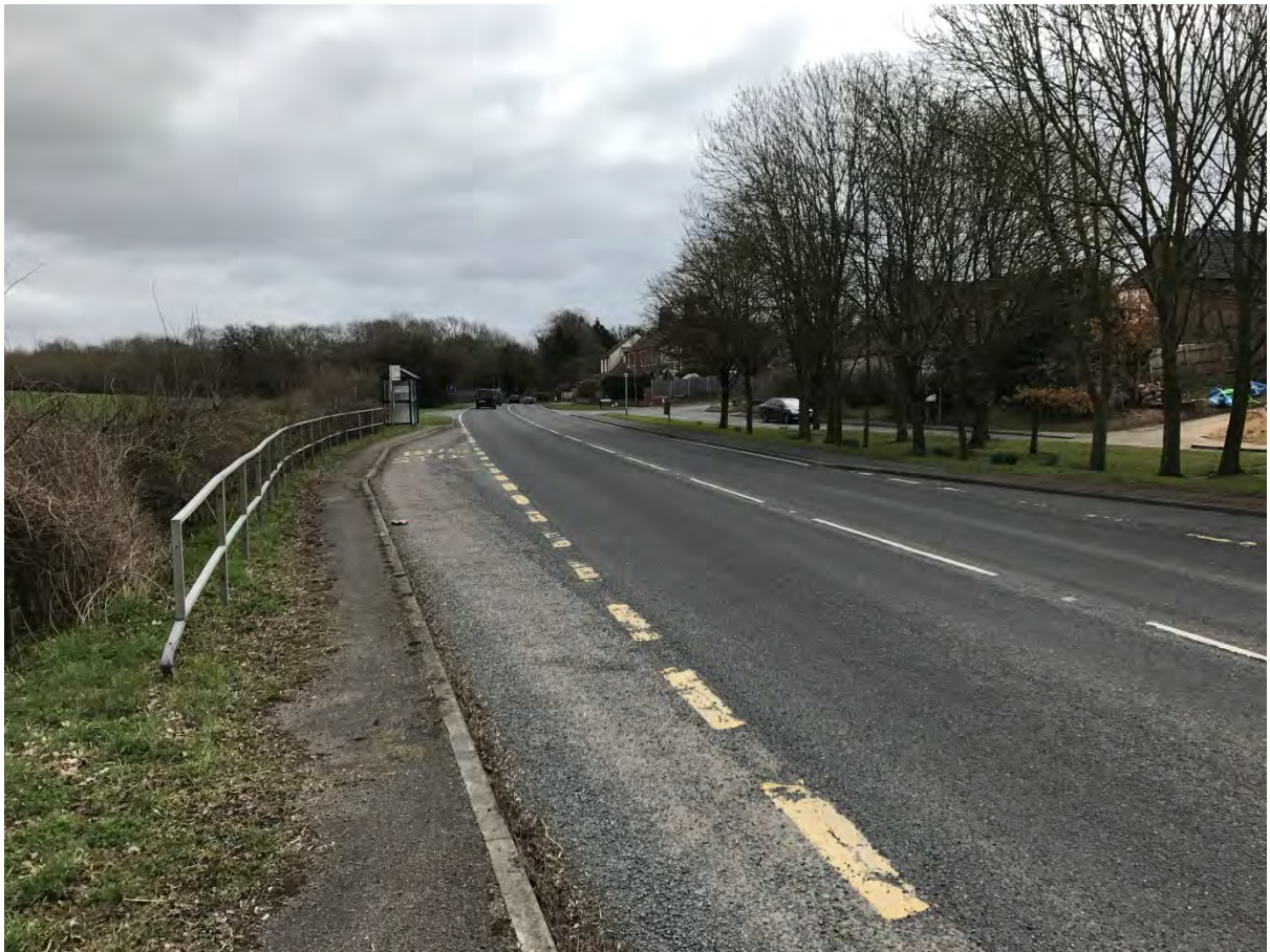
Figure 3: Site 6: Priory Farm (view from Bedford Road)