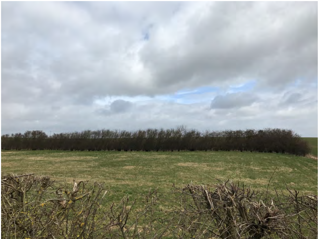
Figure 1: Site 6: Priory Farm (View from Bedford Road)