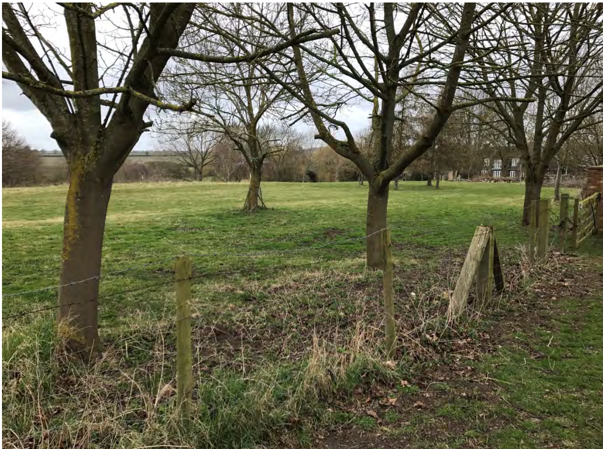
Figure 1: Site 5: Land to the West of Turvey (off Bakers Close)

Figures 1, 2 and 3 are site images of site 5, and its context within the village. Figures 2 and 3 show the existing rural and undeveloped character of the area, and figure 1 provides context of the location of the development in proximity to the existing settlement.