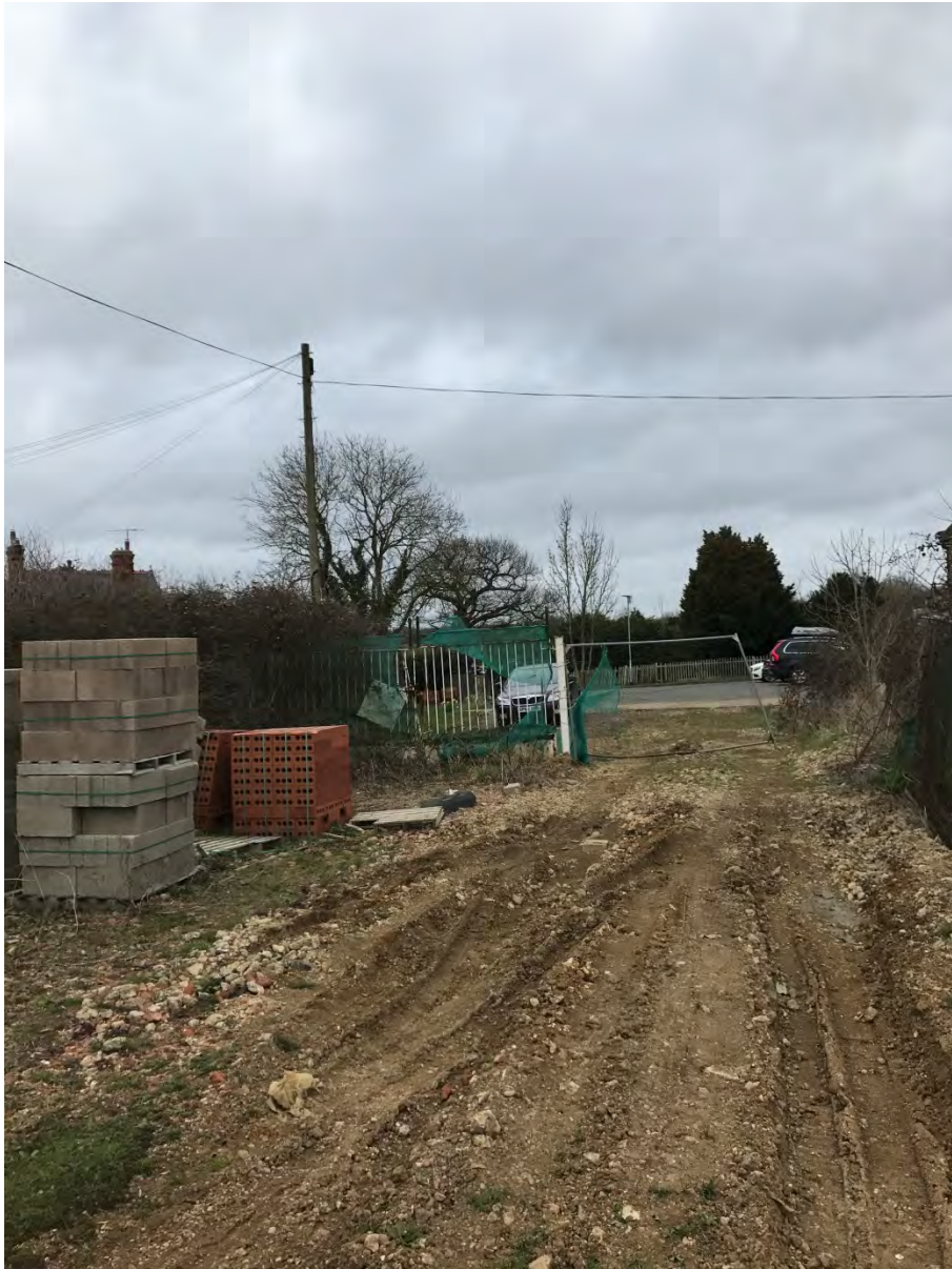
Figure 3: Site 8: Land off Station Road (Access)