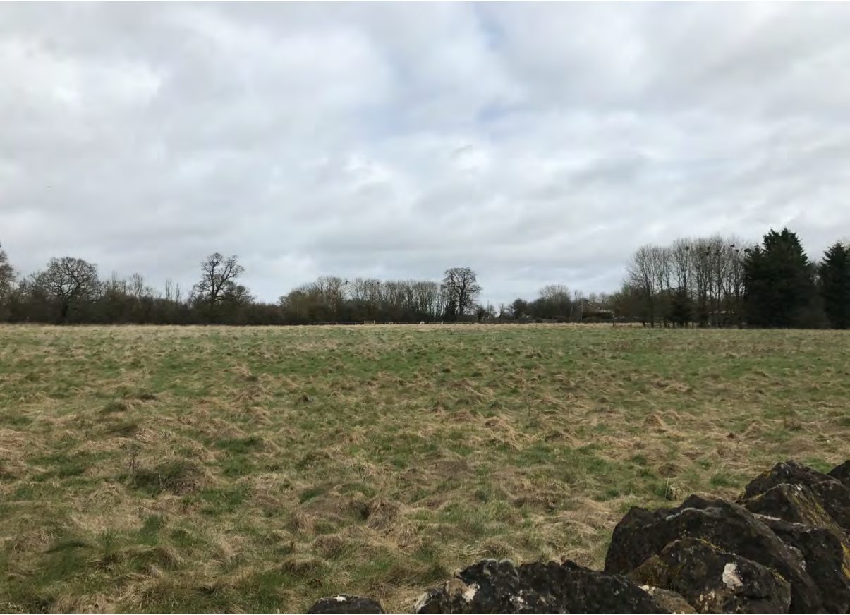
Figure 1: Site 10: Bedford Road