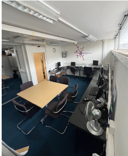
First floor office space