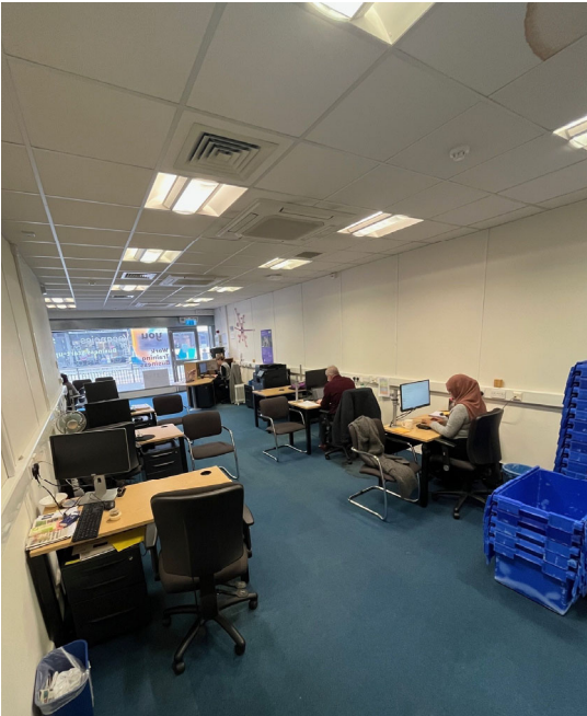
Ground floor retail space