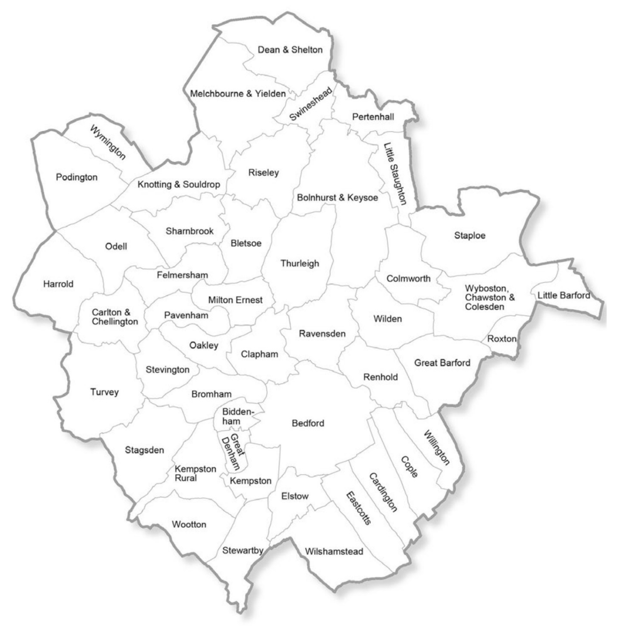
Figure 1 Map of Bedford Borough Wards

12. Bedford is predominantly a rural borough covering 47,641 hectares and comprising the county town of Bedford, the adjacent urban area of Kempston and 45 rural parishes. It has a growing population, which in 2021 Census was estimated at 185,300 (ONS). However, whilst a chiefly a rural borough in terms of area, most of its licensed activity takes place in Bedford town centre.