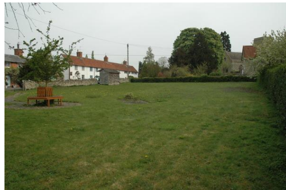
Grassed over former allotment site on the Great Green

25 The centre of the village is less open visually than it was fifty years ago, due to the growth of trees and hedges which have made its subdivisions as conspicuous as the spaces themselves. Next to the former school is the David Bayes Memorial Garden. Two smaller areas between Old Way and the Avenue and in front of Old Pear Tree Cottage are privately owned. The largest, between the Avenue and Memorial Lane retains several apple trees from its days as allotments.