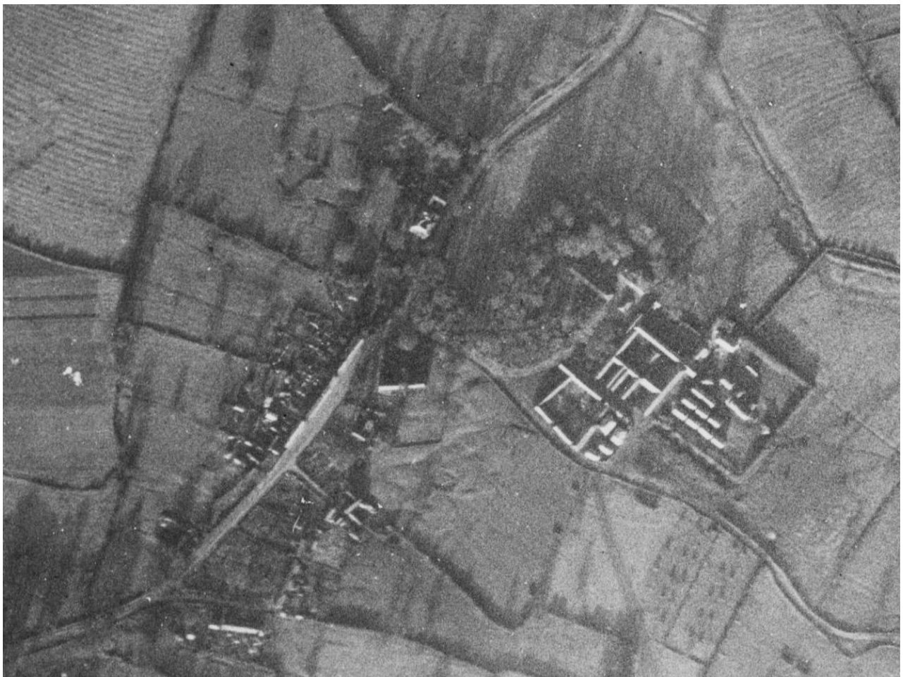
Bletsoe in the 1930s The Avenue at left and Castle Farm right of centre North at the top