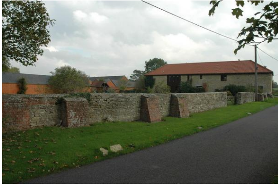
Coplowe Lane: stone walls of former barns

39 Castle Farm, east of Bletsoe Castle, is the site of the manorial home farm: the written survey of the St John Estate in the 1620s mentions building and yards. 19 th century red brick model farm buildings probably incorporated limestone barns facing Coplowe Lane, shown on the 1 st Edition of the Ordnance Survey Map and now represented by a low stone wall with raking brick buttresses.