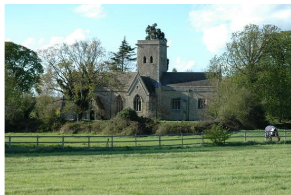
Church, churchyard and land to the south-east

26 The land south-east of the village comprises the paddock south-east of the church and the village field. There is access on foot to the village field from Coplowe Lane, along Old Way to Footpath 16, and past the Village Hall. The paddock between the village field and the church is important in both near and distant views of the church in its churchyard setting.