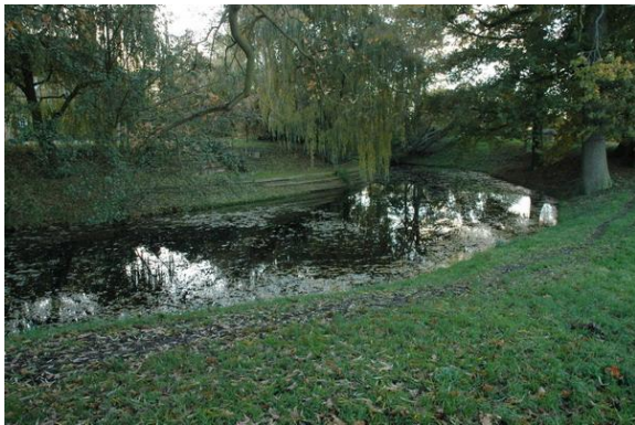
The moat at Bletsoe Castle

36 The medieval parish church is an important focal point, standing up on higher ground within the village in the centre of a compact and partly cleared churchyard. This has low stone walls on three sides holding in ground raised up on its east and south boundaries by centuries of burying; it was extended south at the original lower level in the late 19 th century. The west front of the church faces the Avenue, on which is a solid timber Arts-and-Crafts lych-gate erected by the St Johns in 1912. Mature trees on the north side are part of a generous provision around the road junction, including several large specimen trees planted in the churchyard.