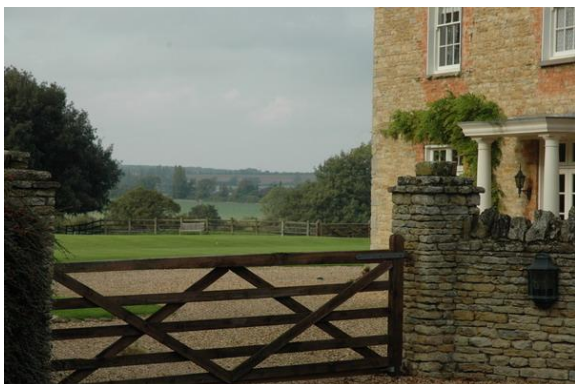
View across the Ouse valley at the Old Rectory

Several views from within the village look across the Ouse valley, from the top of Memorial Lane, from the footpath behind Captain's Close and past the south side of the Old Rectory.