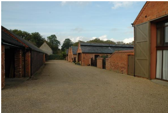
Model farm barn conversions at Castle Farm

The brick barns were converted to residential use in the 1990s, and, though some new-build has been introduced, the model farm plan still reads clearly.