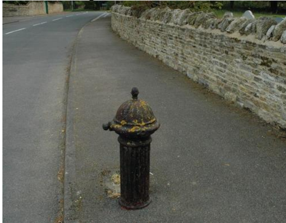
Concrete kerbing, lion's head standpipe, repaired churchyard wall

Rectory; footpath and road surfaces are of black tarmac without gravel rolled into its surface.