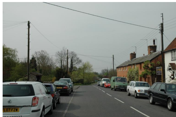
Overhead wiring looking south-west down the Avenue

52 There are several negative visual factors in the proposed Conservation Area. Overhead wiring runs up the Avenue and Memorial Lane with lateral spurs to houses.