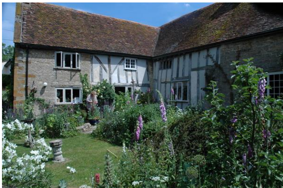
2-3 Old Way: 15 th century open hall at right of centre

43 Several late medieval and early post-medieval buildings survive. Probably the oldest is 2-3 Oldway, beginning as a two-bay open hall with felling dates of 1459/60 for its primary timbers, and 1642/43 for a floor inserted within it.