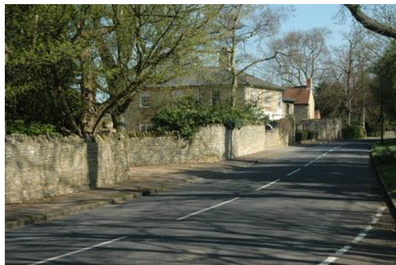
Stone walls looking towards the Old Rectory

38 Where the medieval priest lived is unknown, but his post-Reformation successor occupied the timber-framed building demolished when the present Rectory was built in the 1840s. This was altered and extended at least twice in the 19 th century; its extensive grounds were sub-divided and the southern part was developed in the 1980s. The Old Rectory and a former service building, now a separate dwelling, form a distinct group connected with the main village by long, and in places impressive tall, stone walls through which two new entrances have been cut.