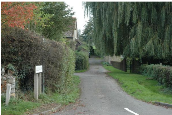
View down Old Way towards the parish field

32 Old Way probably originated as a route between the Great Green and the medieval open fields. A cul-de sac off it serves Old Way Row, a terrace of three built in the 1960s originally as farm cottages. Old Way runs between two houses, on the north side a multi-period 'L' shaped former farmhouse in limestone and timber-frame and on the right a smaller limestone cottage with a large modern rear extension. Beyond them are 19 th century red brick outhouses and the gate leading to the footpath across the parish field.