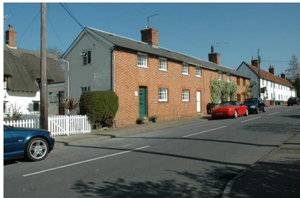
Mid 19 th century brick estate cottages: the Avenue

45 In the 19 th century, the Estate terrace tradition was continued in chequer brick and slate roofs, at the east end of the terrace in Memorial Lane, and in the south-western terrace on the Avenue.