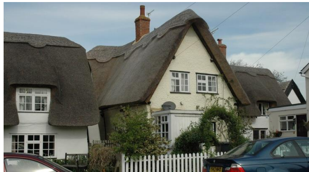
Well maintained thatch on the Avenue

55 The four listed terraces, Top Row, Memorial Lane and the two in the Avenue, present special problems of maintaining their character as individually uniform groups of (mostly) four dwellings. When owned by the Estate, its allocation to families and its maintenance regimes had that effect. Individual ownership has introduced the familiar tension between expressions of individuality and the maintenance of character through neighbourly conformity. Listed building status does provide control though some changes were made before the buildings were listed. A typical problem is roof materials: fortunately, all four cottages in Top Row were last re-thatched at more or less the same time in the same material by the same thatcher.