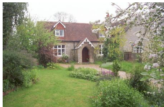
Former village school

30 The upper part, beginning around the break of slope level with the turn into Old Way, is more defined. On the left hand side thatched cottages set further forward than the modern bungalows are followed by two rows of Estate terraces set on the back edge of the pavement. The nearer, in a pleasant chequered mid 19 th century local brick, encroaches upon the space of older timber framed cottages; the further is one of two later 18 th century blocks with fully plastered timber frames. Beyond, on a set-back building line, is a later 1960s terrace in white brick replacing a demolished stone terrace that used to stand on the pavement edge. On the right hand side are characteristic low coursed limestone rubble walls, linking allotment area, school and churchyard. Just before the church is the former village school and school house, built in 1852, closed in the 1960s, and now forming two residences; the playground in front of the school is a mature garden.