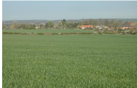
The village in its valley setting from the Thurleigh road

7 Bletsoe lies in a long-settled river valley landscape six miles north of Bedford. A villa site west of the village may represent the centre of a Roman farming estate, and 4 th century burials were found associated with it. The place-name suggests Saxon settlement slightly higher up the valley side, dispersed around the ‘hoh’ or hill-spur where one ‘Blaecc’ once lived. There is no known archaeological evidence from these early times within the proposed Conservation Area.