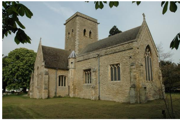
Parish church: chancel at right

37 Probably the Normans built the first stone parish church. Now dedicated to St Mary, it has an apparently simple cruciform plan with a central tower, but closer inspection shows a complicated sequence of development. What exists now dates mainly from the 13 th and 14 th centuries and there was substantial mid 19 th century renovation. The chancel may incorporate some Norman work though the earliest surviving compartment seems to be the 13 th century nave.