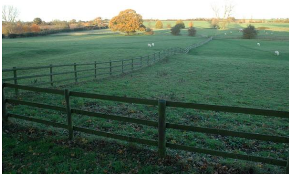
Tudor / Stuart garden remains north of Bletsoe Castle

A closer limit further south-west would be too tight on to the major Castle / garden earthworks and exclude some of the historic garden earthworks running into that field.