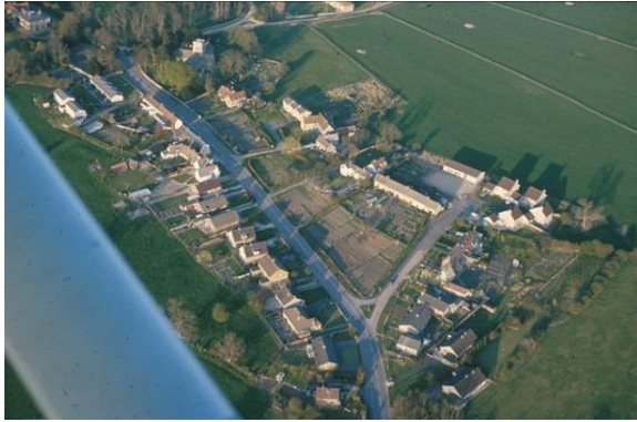
Village centre in mid 1970s: Village Hall centre right

8 The compact form of the village around an open space suggests mid 11 th century planning by the new Norman lords, concentrating settlement below a parish church built in front of their main stronghold. Bletsoe Castle probably consisted originally of timber buildings within a circular bank and ditch. Later, buildings would have been replaced in stone and the ditch enlarged.