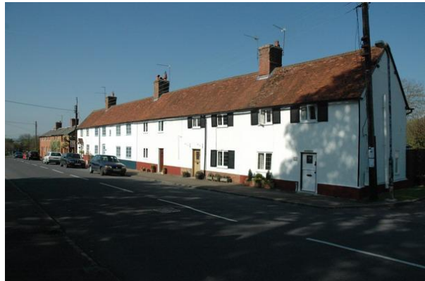
18 th century terrace of estate cottages: the Avenue

44 To the 18 th century belong the two terraces of fully plastered timber-framed buildings, in the Avenue and at Top Row. I Old Way, a small stone cottage, is probably originally of this date, as is the converted stone barn gable end on to Coplowe Lane. All contribute positively to the character and appearance of the Conservation Area.