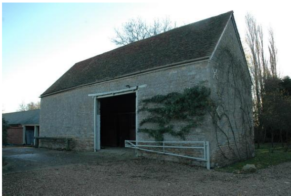
16 th or 17 th century stone barn at Bletsoe Castle

for houses, cottages and stone walls in the village is relatively thin-bedded coursed rubble from exposures in the Ouse valley. The other older cottages are timber-framed with wattle-and-daub infill and, originally at least, thatched roofs. In most cases, and certainly the long estate terraces, the timber frame was relatively slight and fully plastered as constructed. The 19 th century chequer-brick cottages drew upon local clay fired in one of several documented local kilns; the bricks for model barns at Castle Farm probably came from further afield. These brick buildings have slated roofs; elsewhere, traditional thatched roofs are being well maintained in long straw and combed wheat reed.