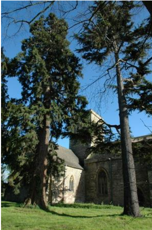
Specimen trees in the churchyard

47 The most notable trees, some covered by Tree Preservation Orders, are in the northern character area, in the grounds of Bletsoe Castle, the Old Rectory and the churchyard.