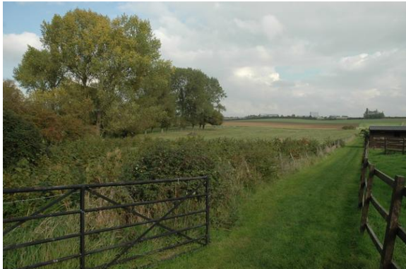
View out north-east towards site of Whitwick Green

27 There are several important views from within the Conservation Area out to the surrounding landscape. The view north from Bletsoe Castle looks across the former medieval deer park towards Park Farm, on the site of the medieval park keeper's lodge. From the north-east side of Castle Farm Barns, the view towards the skyline buildings of the Thurleigh Business Park takes in the site of Whitwick End, a Bletsoe hamlet demolished to make way for the wartime airfield.