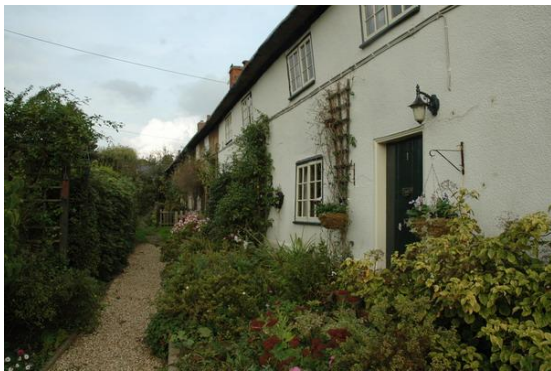
View across the front of Top Row

31 From the War Memorial, going along Memorial Lane towards the Village Hall, modern bungalows on the right hand side are followed by a truncated timber-framed house before the road rises on to higher ground with another terrace of Estate cottages. At the near end is a mid 19 th century red brick addition or rebuilding, with a possibly 18 th century element in the middle and is a 16 th or 17 th century timber-framed house at the higher far end. Opposite it, on the north side, at right-angles and gable end on to the lane is Top Row, the other later 18 th century terrace built of fully plastered timber frame, with an attractive view along the flower-beds between the houses and the access path.