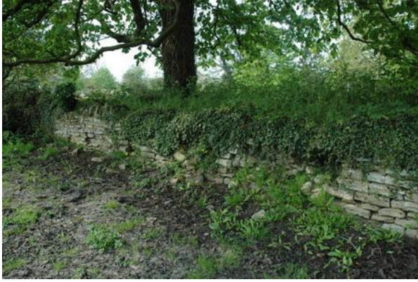
Unrepaired churchyard wall