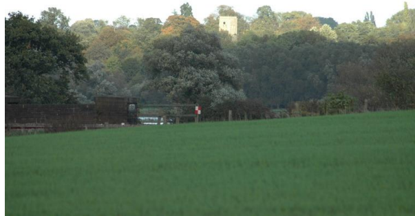
Church tower as a landmark from the Radwell road

12 Bletsoe's position on an eastern terrace of the Great Ouse valley makes it visible in the landscape from several directions. The best external view is from the east coming down the valley side, along Coplowe Lane and Footpath 16. The church tower is a landmark in distant views: from the south, on the sharp bend of the main road leaving Milton Ernest, it appears above surrounding trees; from the distant west on the Radwell road it can be seen across the river; nearer, it appears higher up the valley slope from the A6 road running parallel with the river.