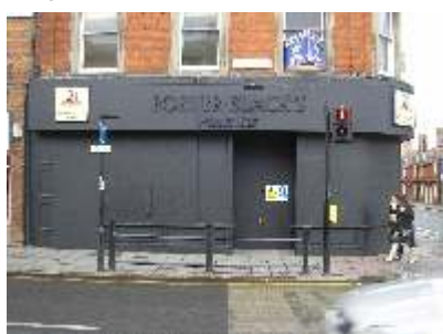
80 High Street