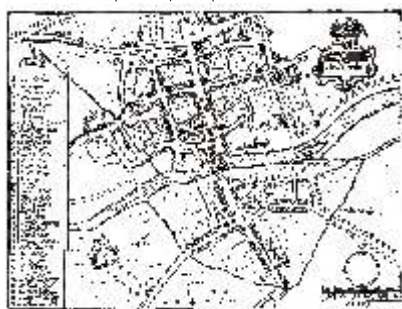
Bedford 1610 (John Speed)