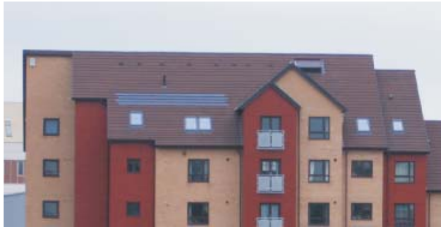
These photovoltaic roof tiles at Kingsway House, 13 Kingsway, Bedford have a rated power output of 1.25 kW.