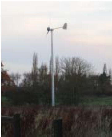
This wind turbine at 53 North End, Bletsoe has a rated power output of 5 kW.