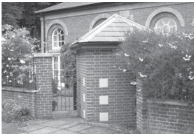
A well designed communal bin store on the frontage of a residential development

Advice to developers, architects and designers on best practice when designing refuse and recycling facilities for new residential development