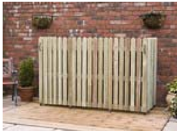
A simple, neat and commercially available "Three Wheelie" front garden store for an individual household

As Waste Collection Authority, Bedford Borough Council requires each householder to manage and take responsibility for their own domestic refuse and sorting of their recycling at source. It is important that future residents can do this easily, conveniently and in a way that does not adversely affect the residential environment of any new dwelling, its near neighbours or the area as a whole. The principle of ensuring that all new dwellings are provided with adequate storage for solid wastes has been incorporated into the Building Regulations. Bedford Borough Council has powers under Section 46 of the Environmental Protection Act 1990 to stipulate the level of storage for refuse and recyclables that should be provided to serve each new dwelling in the Borough. The planning policies of the development plan in relation to waste are material considerations in the decision to be made about any planning application for new homes within the Borough.