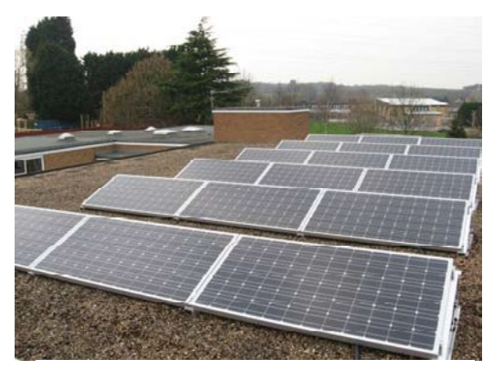
Solar PV panels installed on Scott Lower School's roof

Power Generation Display Units were also installed in the reception or hall at each school to raise awareness of the installation of the solar PV panels to the pupils, staff and visitors to the school.