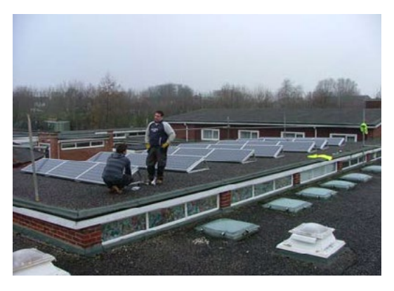
Solar PV panels being installed on Brickhill Lower School's roof

each had a 3.88 kWp solar photovoltaic (PV) system consisting of 21 panels each, installed on their roofs, with funding from the local councillors' Ward Funds and 50% match-funding from the Mayor's Climate Change Fund.